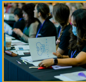
By and for Pelvic Rehab